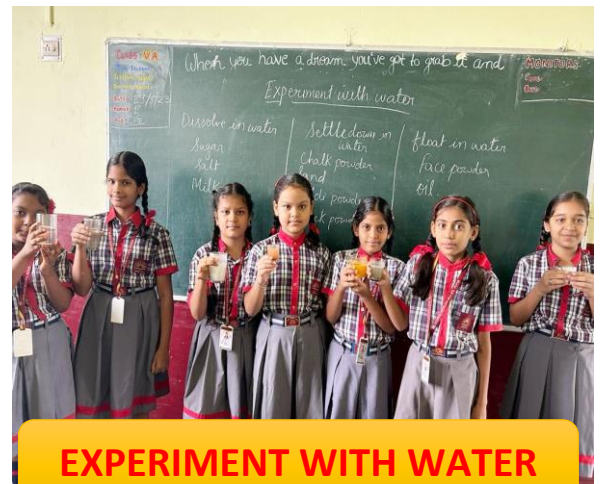
EXPERIMENT WITH WATER