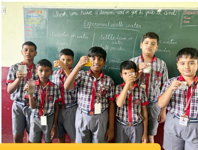
EXPERIMENT WITH WATER